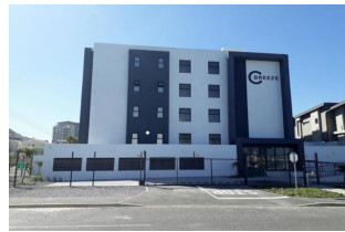
2 bedroom apartment in Waves Edge