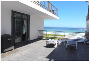
2 bedroom apartment in Big Bay