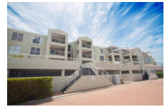
2 bedroom apartment in Big Bay