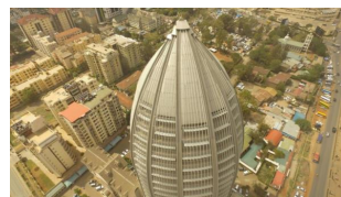
304 m 2 commercial office in Kilimani (Kenya)