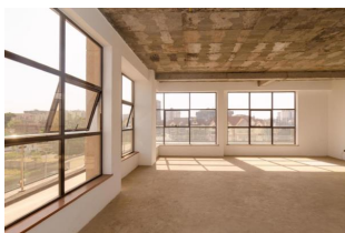
189 m 2 commercial office in Kilimani (Kenya)