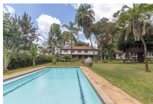
1.14 acres commercial vacant land in Upper Hill (Kenya)