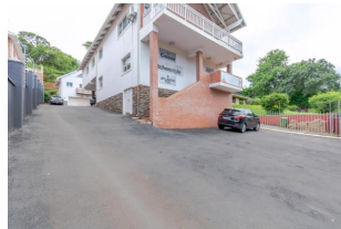
330 m 2 commercial office in Durban North R3,600,000