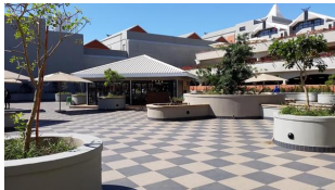
117 m 2 commercial office in uMhlanga R2,000,000