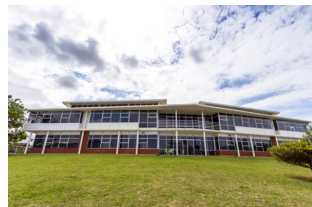
519 m 2 commercial office in La Lucia R83,000 per month