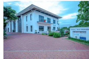
102 m 2 commercial office in La Lucia R2,300,000