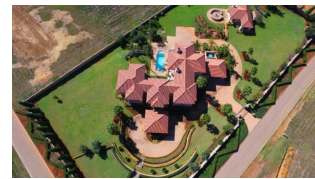
5 bedroom house in Mooikloof Glen R10,950,000