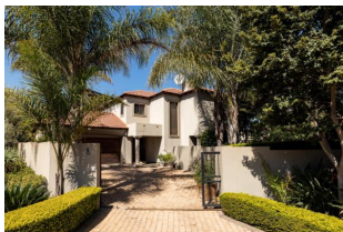
3 bedroom house in Mooikloof Gardens R1,959,000