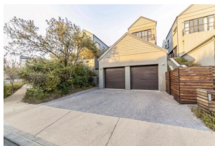
4 bedroom cluster house in Steyn City R50,000 per month