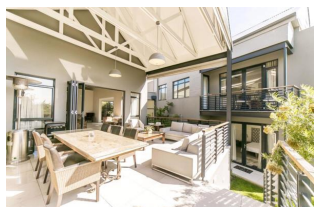
4 bedroom house in Steyn City R6,800,000