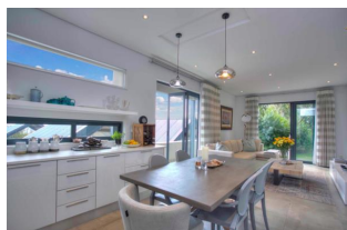
1 bedroom apartment in Steyn City R2,150,000