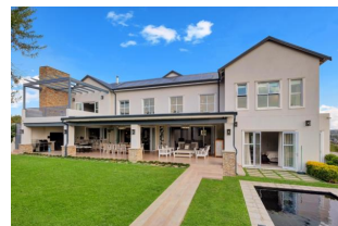
5 bedroom house in Steyn City R110,000 per month