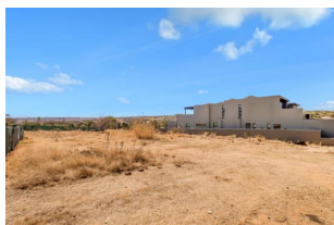
1279 m 2 vacant land in Steyn City R5,500,000