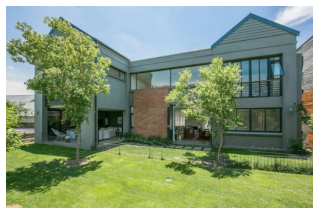
3 bedroom cluster house in Steyn City R50,000 per month