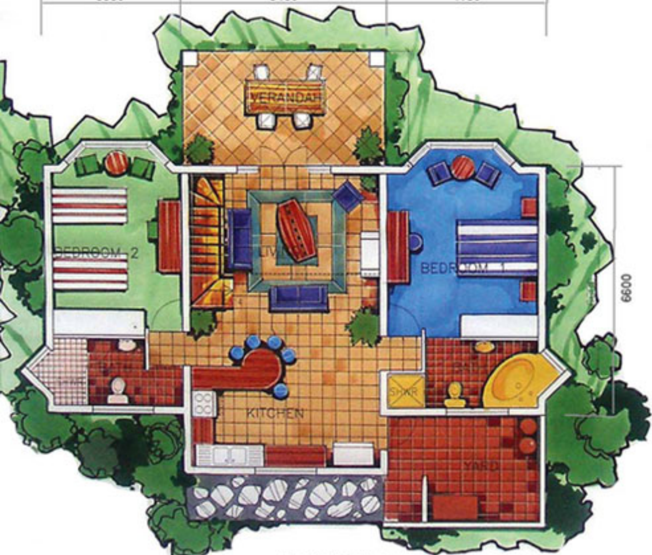
TYPICAL PLAN TYPE A