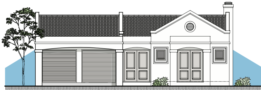
TYPICAL STREET ELEVATION