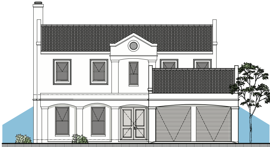
TYPICAL STREET ELEVATION