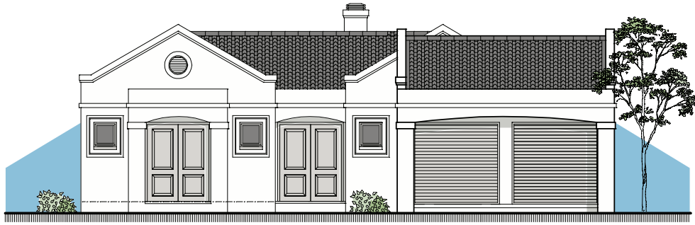
TYPICAL STREET ELEVATION