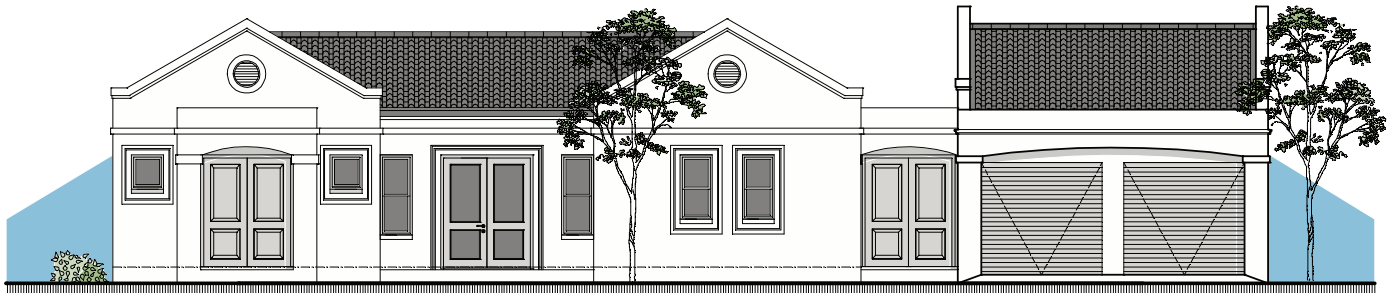
TYPICAL STREET ELEVATION